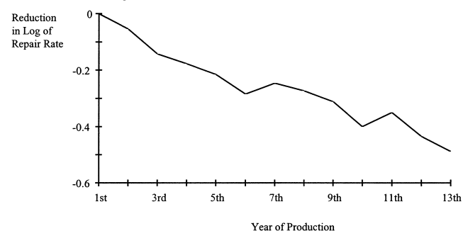
Figure 2 Learning Curve (on Log Scale) for Car Model Repair Rate as Measured During the Third Year of Ownership a

a Plotted points correspond to the coefficients listed in Equation 8 of Table 4.