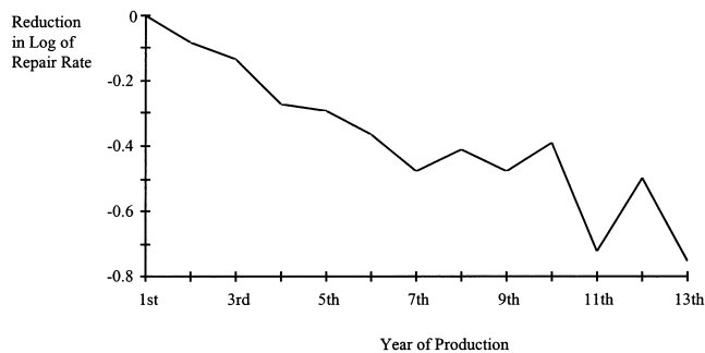
Figure 3 Learning Curve (on Log Scale) for Car Model Repair Rate, as Measured During the Sixth Year of Ownership a

a Plotted points correspond to the coefficients listed in Equation 8 of Table 5.