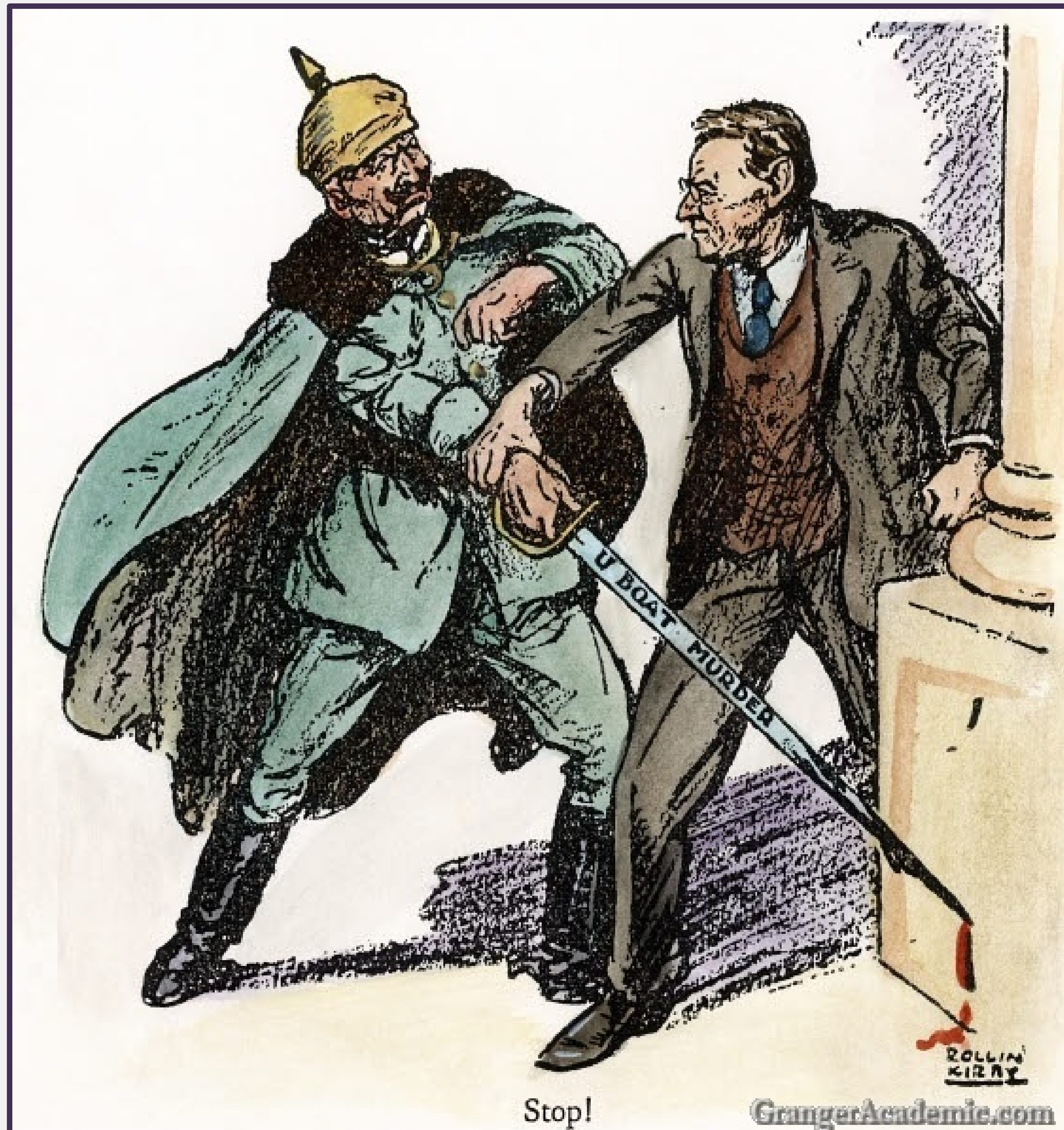
From the New York World; Cartoon by Rollin Kirby, 1916 Pictured: Wilson confidently disarms the Kaiser of the sword of "U Boat Murder"