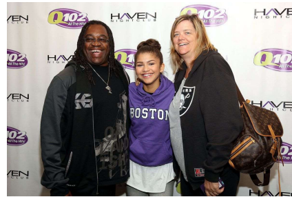
Multiracial American actress Zendaya with her parents.