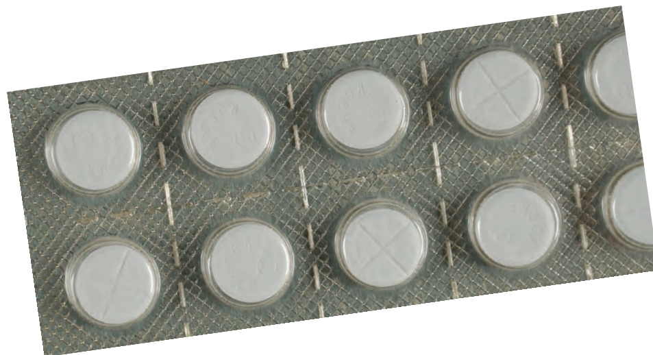
Blister pack of Rohypnol® tablets

Rohypnol® is a Schedule IV substance under the Controlled Substances Act. Rohypnol® is not approved for manufacture, sale, use, or importation to the United States. However, it is legally manufactured and marketed in other countries. Penalties for possession, trafficking, and distribution involving one gram or more are the same as those of a Schedule I drug.