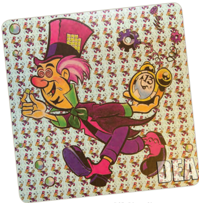
LSD Blotter Sheet