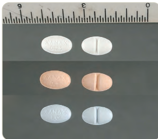
Xanax 0.25, 0.5 and 1mg scored tablets

Generally, legitimate pharmaceutical products are diverted to the illicit market. Teens can obtain depressants from the family medicine cabinet, friends, family members, the Internet, doctors, and hospitals.