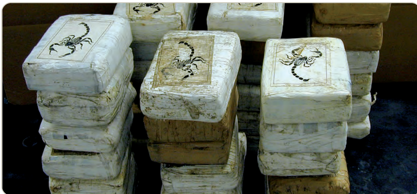
Cocaine bricks, seized by DEA

Cocaine is a Schedule II drug under the Controlled Substances Act, meaning it has a high potential for abuse and has an accepted medical use for treatment in the United States. Cocaine hydrochloride solution (4 percent and 10 percent) is used primarily as a topical local anesthetic for the upper respiratory tract. It also is used to reduce bleeding of the mucous membranes in the mouth, throat, and nasal cavities. However, more effective products have been developed for these purposes, and cocaine is now rarely used medically in the United States.