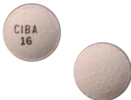
Ritalin SR 20mg tablet

Stimulants are diverted from legitimate channels and clandestinely manufactured exclusively for the illicit market.