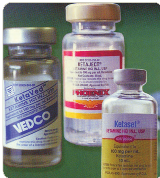
Vials containing liquid ketamine

Ketamine, along with the other “club drugs,” has become popular among teens and young adults at dance clubs and “raves.” Ketamine is manufactured commercially as a powder or liquid. Powdered ketamine is also formed from pharmaceutical ketamine by evaporating the liquid using hot plates, warming trays, or microwave ovens, a process that