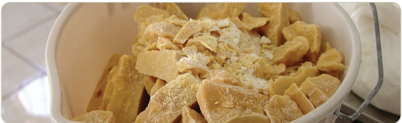
Methamphetamine in finished form

Methamphetamine is a Schedule II stimulant under the Controlled Substances Act, which means that it has a high potential for abuse and a currently accepted medical use (in FDA-approved products). It is available only through a prescription that cannot be refilled. Today there is only one legal meth product, Desoxyn®. It is currently marketed in 5, 10, and 15-milligram tablets (immediate release and extended release formulations) and has very limited use in the treatment of obesity and attention deficit hyperactivity disorder (ADHD).