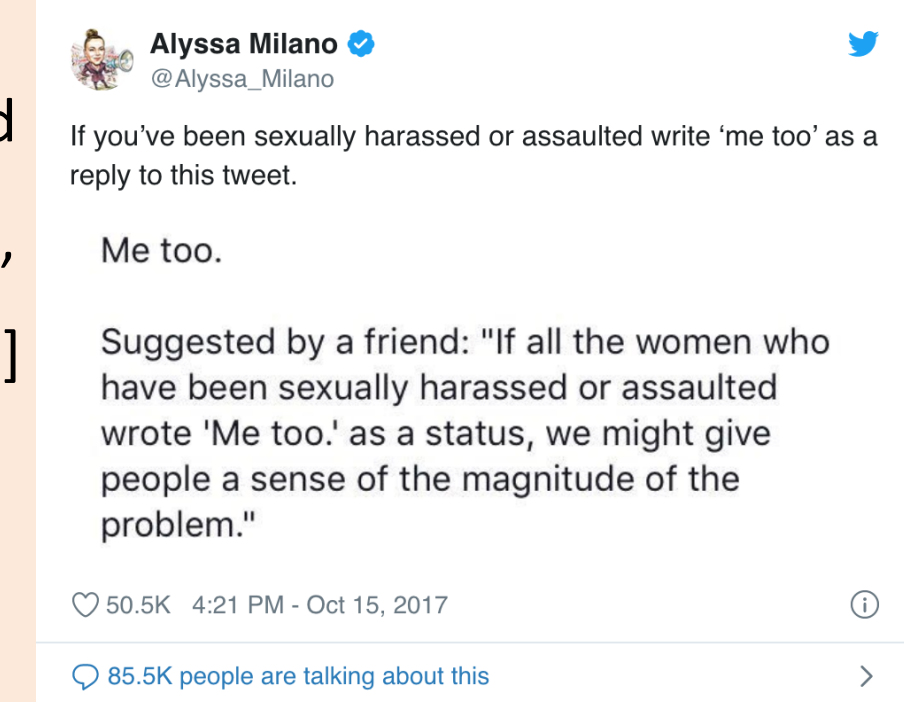
Fig. 1. The tweet from Alyssa Milano that revolutionized the Me Too movement on social media platforms from Sayej, Nadja; The Guardian, Guardian News and Media, 1 Dec. 2017, www.theguardian.com/culture/2017/dec/01/alyssa-milano-mee-too-sexual-harassment-abuse .