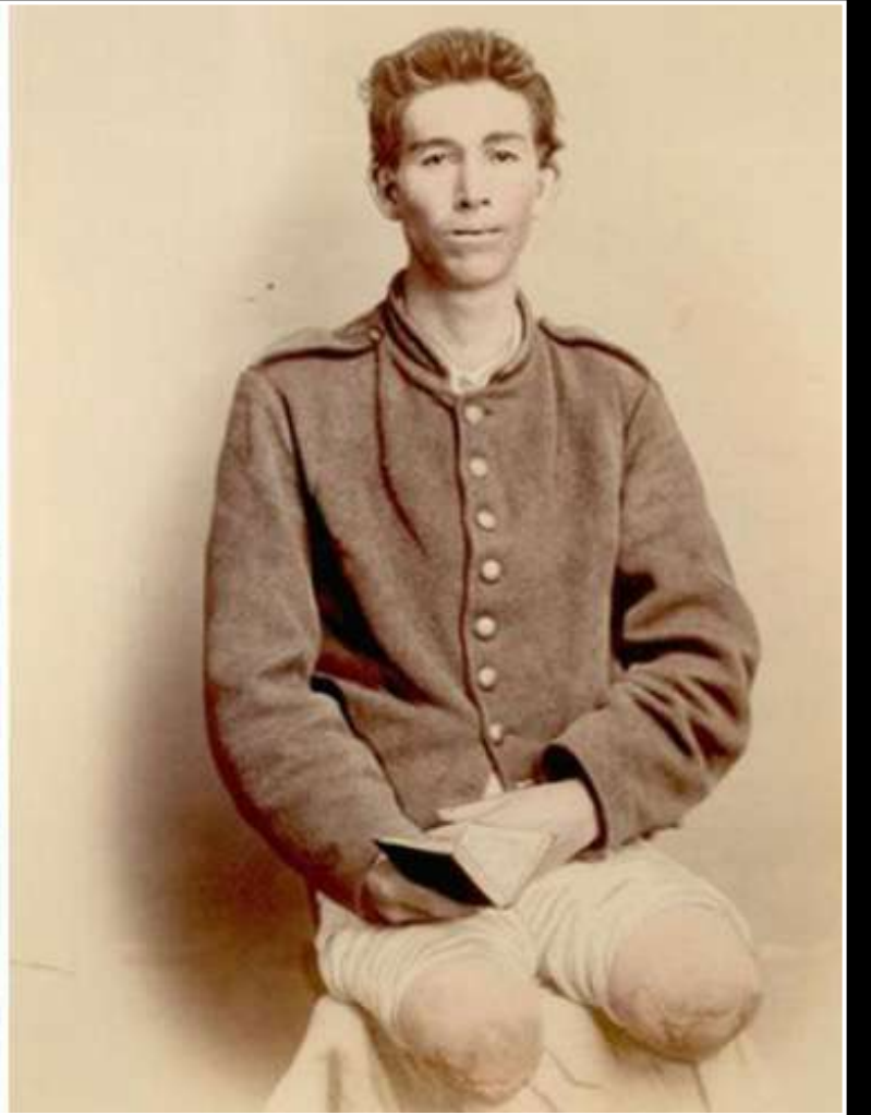
U.S. Civil War Veterans